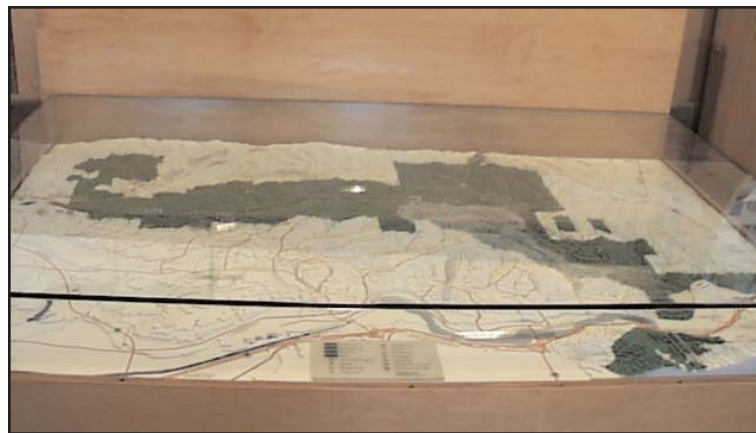
An Eagle Scout project - a topographic map made out of wood.

Most of the projects offer scouts a chance to develop basic carpentry and woodworking skills. Best of all, these projects give a young scout the opportunity to make a positive and lasting impact to their community and our Park! Please email me at bgrant@parks.ca.gov for more information on available projects.